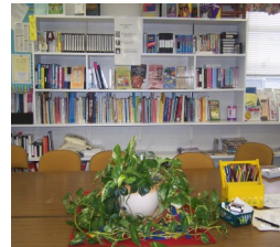
A Portion of the PRC Lending Library

When schools are closed, the PRC is closed.