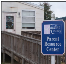
The PRC is located behind Bowling Green Elementary School in Trailer #1