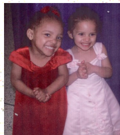
Your Ticket to Parent Involvement

This information & much more will be available 3-14-15 at Family Fair. Please join us!!